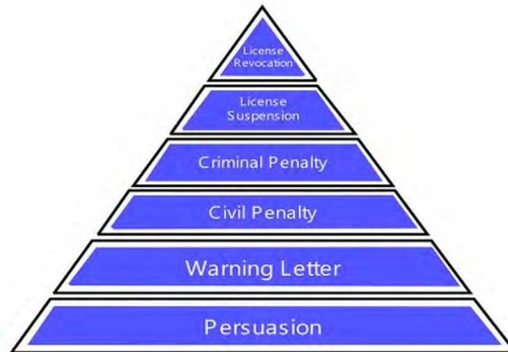
Figure 1: Example of a Regulatory Pyramid

persuasion, at its base, through warning and civil penalties up to criminal penalties, license suspensions and then license revocations. Regulatory approaches would begin at the bottom of the pyramid and escalate in response to compliance failures. There would be a presumption that regulation should always start at the base of the pyramid. 17